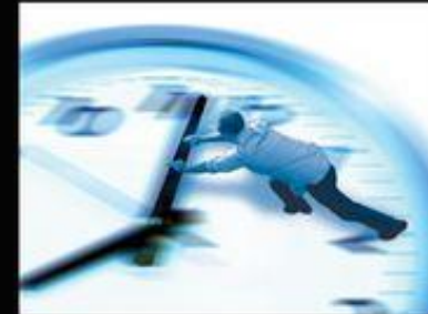
what my customers think I do