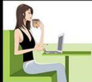
what my mom thinks I do