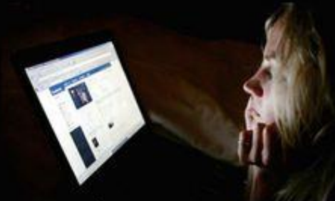
what I actually do