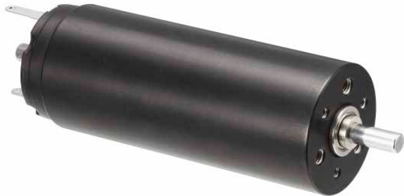
FAULHABER DC Micromotor 2668 CR

Assume that it is necessary to determine the power of which a particular motor, 2668W024CR is expected to deliver at cold operation with a torque load of 68 mNm at a speed of 7 370 min -1 . The product of the torque, speed, and the appropriate conversion factor is shown below.